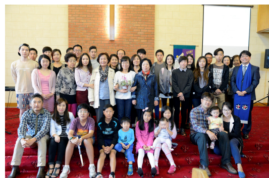
UCA SA Korean Congregation at St Morris