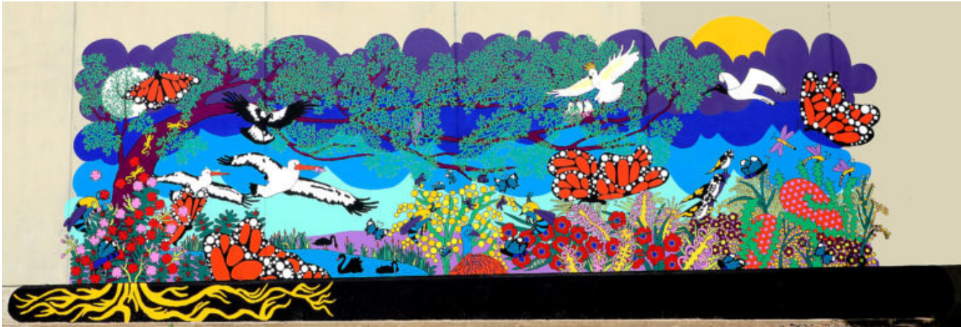
Port Adelaide Uniting Church—Bent Pine Community Garden Mural

The service was followed by a BBQ tea in the new Bent Pine community garden.